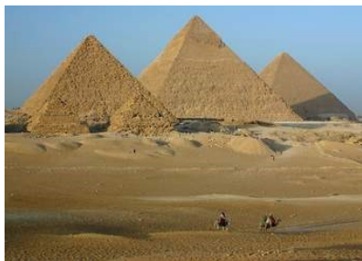
The Great Pyramids of Giza